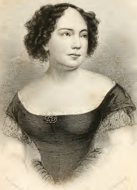
Anna Eliza Carroll